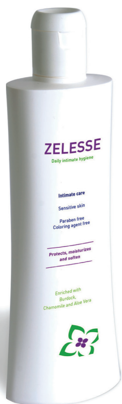
Bottle of 250ml